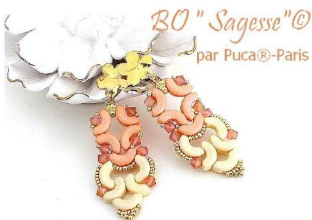
BO "Sagesse"© par Puca®-Paris

Arcos® Vogue Mat Orange Peach et Vogue Mat Stone